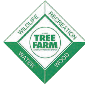
SC Tree Farm Committee