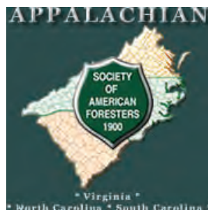
South Carolina Division, Appalachian Society of American Foresters