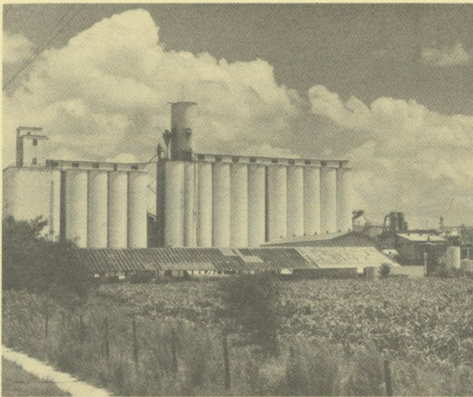
Southern Soya Corporation