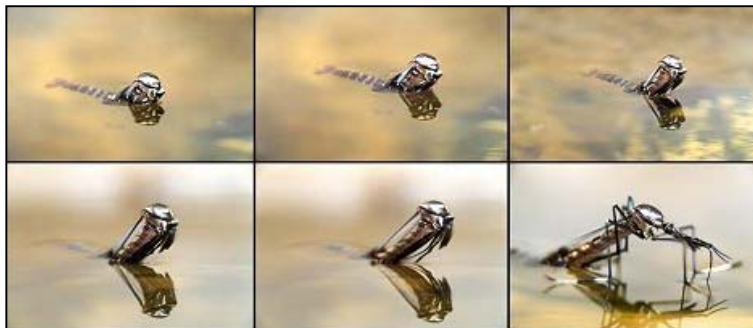
Adult Toxorhynchites emergence, ( T. speciosus shown); Photo: S. Doggett, © 1999

first described in 1906 from 13 males and 11 females from Virginia, West Virginia, District of Columbia, Maryland, North Carolina, Mississippi and Louisiana (Jenkins 1949).