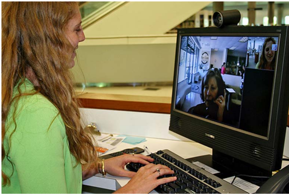
LIBRARIANS AS TECHNOLOGY GURUS—1 st Place. Richland County Public Library: RCPL's Video Messaging allows RCPL patrons at The Link, Ballentine to speak directly with RCPL librarians.