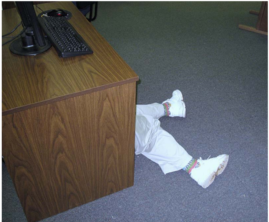
MOST HUMOROUS—2 nd Place. Laurens County Library: Computer Maintenance ...or ... Murder in the Library??