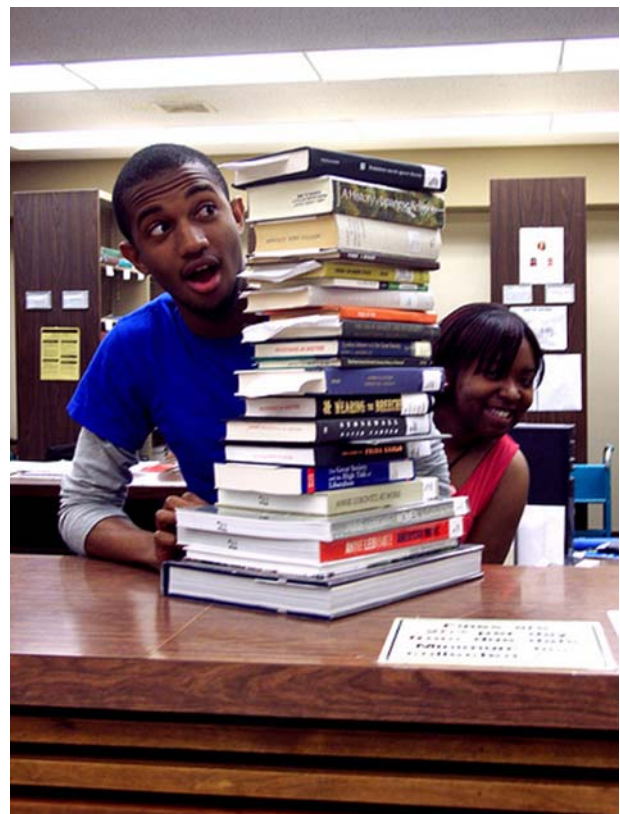
Winthrop University Library: PASCAL DOES Deliver!