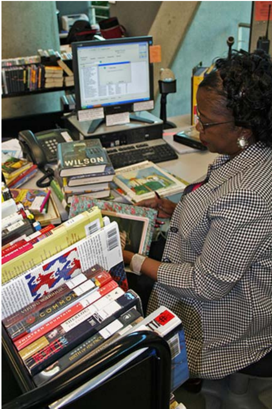
BEST OVERALL—2 nd Place. Richland County Public Library: Circulation Overload!