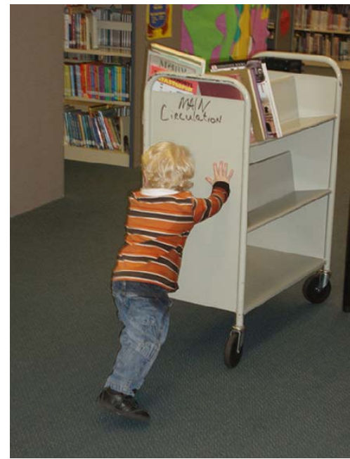
Charleston County Public Library: The reality of new budget cuts...