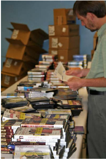
Richland County Public Library: Too many titles to choose from!