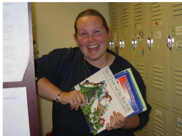
Anderson County Library: Even shelving is fun!

Our Vision: The South Carolina State Library is a national model for innovation, collaboration, leadership and effectiveness. It is the keystone in South Carolina's intellectual landscape. Our Mission: We optimize South Carolina's investment in library and information services.