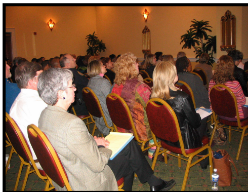
Photograph of attendees at the March 20 charrette

law enforcement officers, nurses and education professionals for their dedication and commitment on behalf of South Carolina's children.