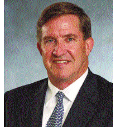
Hugh E. Weathers Commissioner

Farm-fresh fruits and vegetables, specialty food products, wine and gourmet items, artisan and craft items, as well as specialty shops will be featured. In short, anything made or produced on a farm can be found at Five Rivers. Vendors do not have to be present to sell items. Once the space is set up, Five Rivers Market takes care of the rest. Their motto is "We make it affordable for small business to do business!"