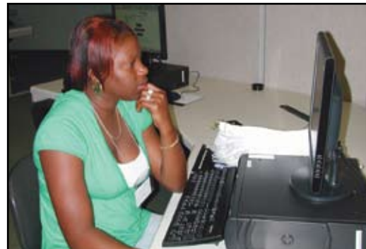
A total of 78 computers have been installed in the Stanton Academic Computer Center during the summer months.

FMU continues to strive to bring the most up-to-date technologies to the campus to benefit students, professors and the community.