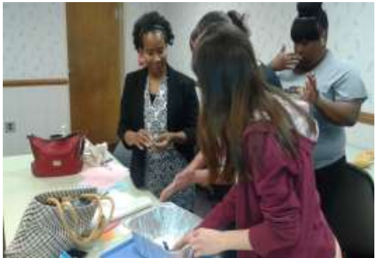
Child Care teachers participant in hands on science activities.