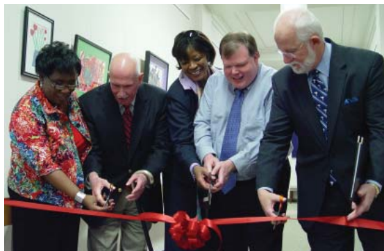
Official Ribbon Cutting

On April 12, 2008, young artists, teachers and friends attended a ribbon cutting ceremony to open the new student art gallery. The gallery features artwork from students who are blind, visually impaired and physically handicapped from across the state.