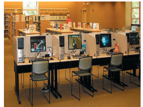
Carvers Bay Branch Library