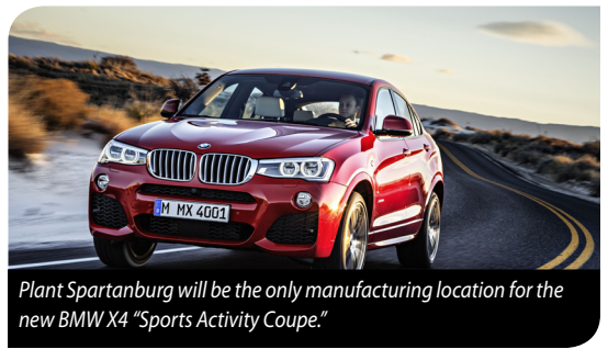
Plant Spartanburg will be the only manufacturing location for the new BMW X4 "Sports Activity Coupe."

BMW announced in March that it will invest another $1 billion in its Greer, SC manufacturing plant, its second major expansion in the last two years. The new investment includes the establishment of a fifth vehicle platform at Plant Spartanburg, the X7. Total units produced at the site is expected to grow from 350,000 per year to 450,000 making it the highest production capacity plant in the BMW system by the end of 2016. Currently, about 70% of the vehicles are exported. The news on the X7 comes on the heels of the announcement in January 2013 that BMW will be producing the X4 in Greer, a $900 million investment. BMW will soon be producing the X3, X4, X5, X6 and X7 model Sports Activity Vehicles at Plant Spartanburg. Since the original decision to build BMW's only U.S. plant in South Carolina in 1992, BMW's investment in South Carolina has totaled $6.3 billion. This latest announcement represents its largest, single investment to date in its South Carolina presence and the fifth major expansion of the plant. South Carolina's automotive industry has quadrupled in the past two decades, according to South Carolina Department of Commerce data. The sector employs approximately 46,700 South Carolinians at more than 250 firms.