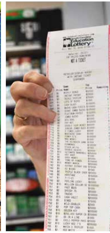
The current Top Prizes Remaining Report must be posted.