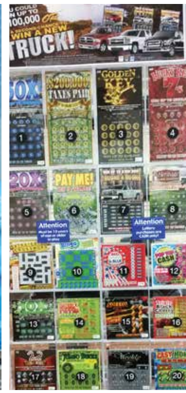
Dispensers must be full with tickets forward facing and upright.