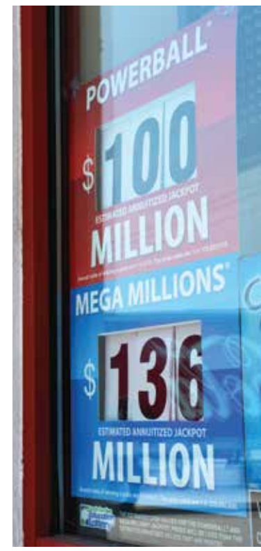
Powerball® and Mega Millions® jackpot signs must show the current, correct amount.