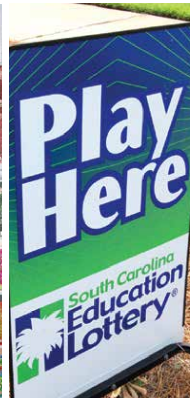
You must have an exterior sign to identify location as a lottery retailer.