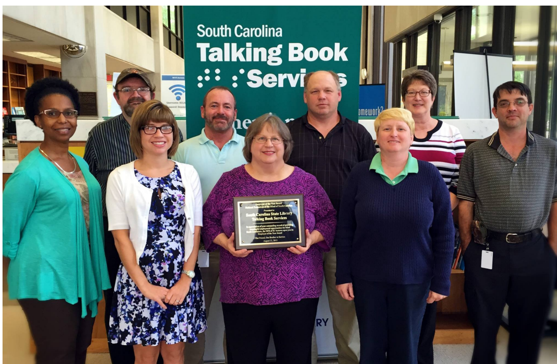
Talking Book staff with Employer of the Year Award

We are deeply honored to be recognized by the NFB. We strive to serve the blind community in all ways.