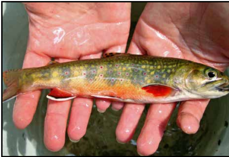
A donation from the Chattooga River Chapter of Trout Unlimited will help with a genetics study of Southern Appalachian brook trout.