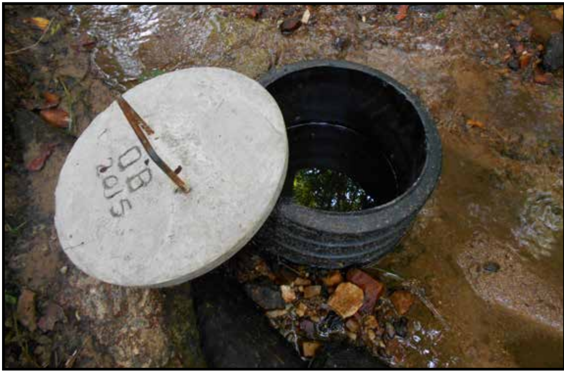
The design Drew Boggs came up with for a cistern will likely be a model for any future improvements to Foothills Trail water sources.