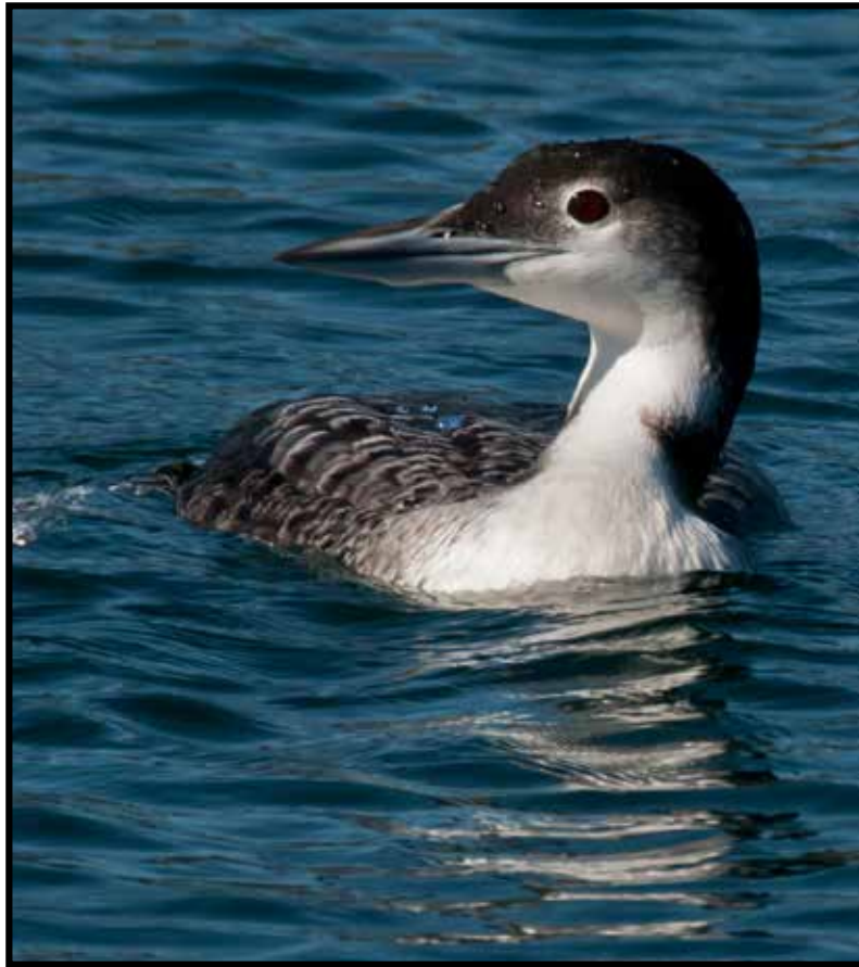
Not much is known about the behavior of common loons during winter months.