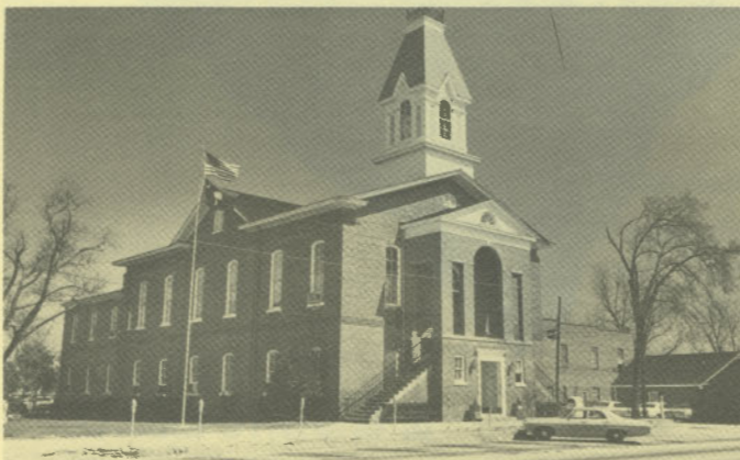
Chesterfield County Courthouse