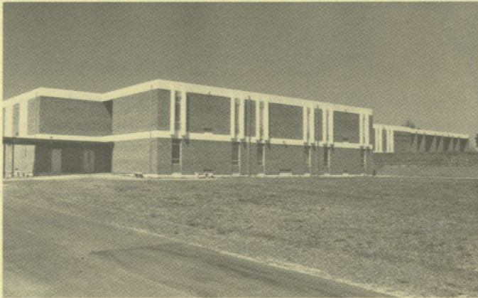
Chesterfield High School