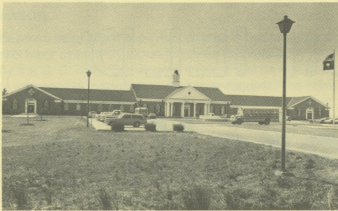
Chesterfield-Marlboro Technical Education Center