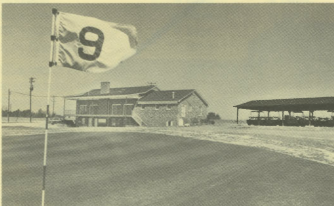
Green River Country Club