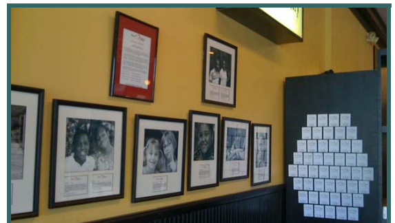
Permanent Heart Gallery Exhibit Jason's Deli, Charleston, SC