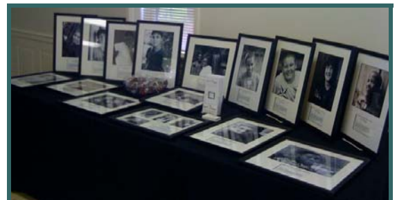
Heart Gallery Exhibit Rose Hill Presbyterian Church, Columbia, SC