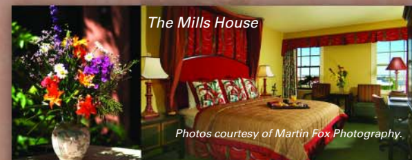
The Mills House