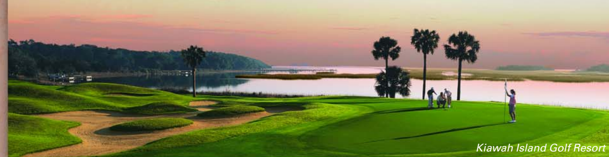
Kiawah Island Golf Resort

On the other side of Charleston, on the romantic Isle of Palms, the offer includes the world-renowned Wild Dunes Harbor and Dunes courses. Also available