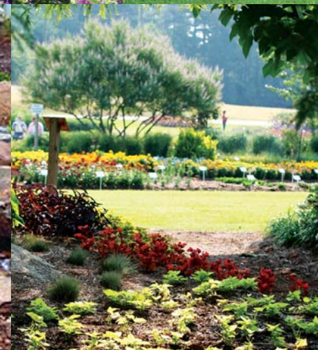
Top Left: Summerville Azalea Park, Summerville, SC Top Right: Edisto Memorial Gardens, Orangeburg, SC