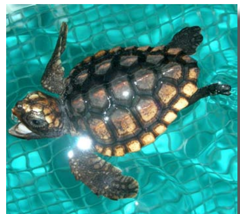
Photography of loggerhead hatchling by Barbara Bergwerf.

Free Turtle Shields: Send a self-addressed, stamped business size (#10) envelope to (up to five per envelope): Free Turtle Shields 407 Glenwood Drive, Georgetown, KY 40324.